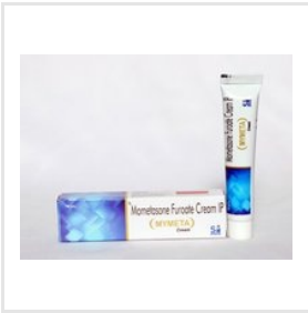
Mometasone 0.1% W/W Cream