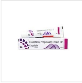
Clobetasol Propionate 0.05% W/W Cream