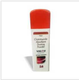
Clotrimazole Absorbent Dusting