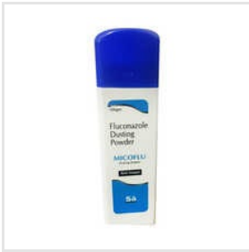
Fluconazole Dusting Powder