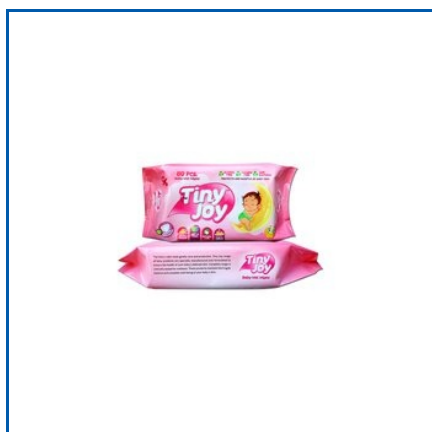
BABY WET WIPES

100gm Aloe Vera Cream, 100ml Soft Lotion, 100ml Zerozit Skincare Anti Acne Face Wash, 50ml Permethrin And Cetrimeide Lotion, Anti Allergic Drugs, Adacin Gel, Adacin Gel, Adapalene 0.1% + Clindamycin 1% Cream, Amoxicillin Trihydrate, Potassium Clavulanate And Lactic Acid Bacillus Tablets, Anti Acne Face Wash With Glycolic Acid, Azithromycin 500 Tablets Ip, Azithromycin Tablets Ip, Baby Wet Wipes, Beclomethasone Dipropionate 5% W/v Lotion, Etc.