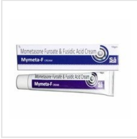
Mometasone Furoate 0.1% W/W And Fusidic