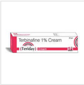
Terbinafine 1%W/W Cream