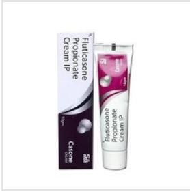
Fluticasone Propionate 0.05% W/W Cream