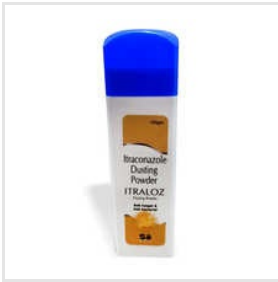
Itraconazole Dusting Powder