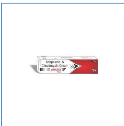
ADAPALENE 0.1% + CLINDAMYCIN 1% CREAM