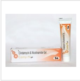
Clindamycin 1% W/W + Nicotinamide 4% W/W