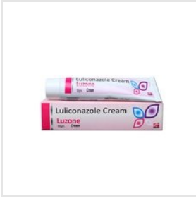
Luliconazole 1%W/W Cream(50gm)