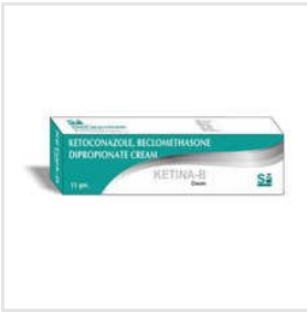
Ketoconazole 2% + Beclomethasone