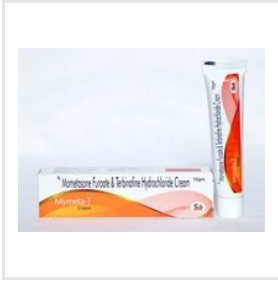
Mometasone Furoate .1% W/W+ Terbinatine