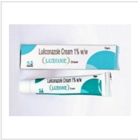
Luliconazole 1%W/W Cream